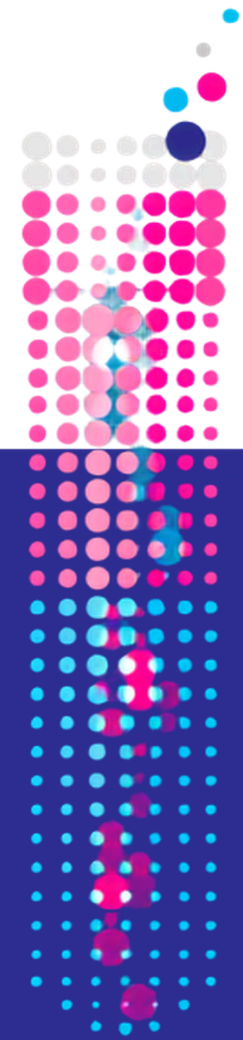
Table Sponsor £150